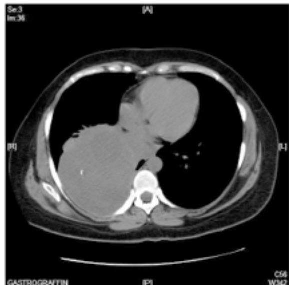
Figure 2: Preoperative CT scan