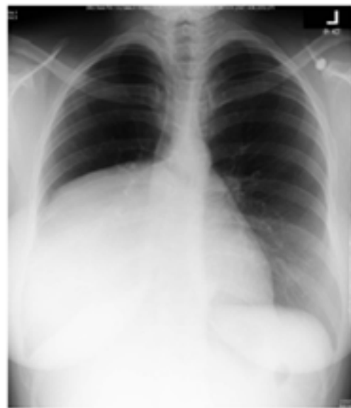
Figure 1: Initial chest x-ray